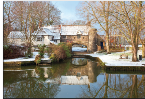
Above: The fifteenth century flint archway at Pulls Ferry marks the start of an ancient canal built by the monks to ferry stone for building Norwich Cathedral. Here Pulls Ferry is reflected in the waters of the River Wensum on a snowy Norwich morning.