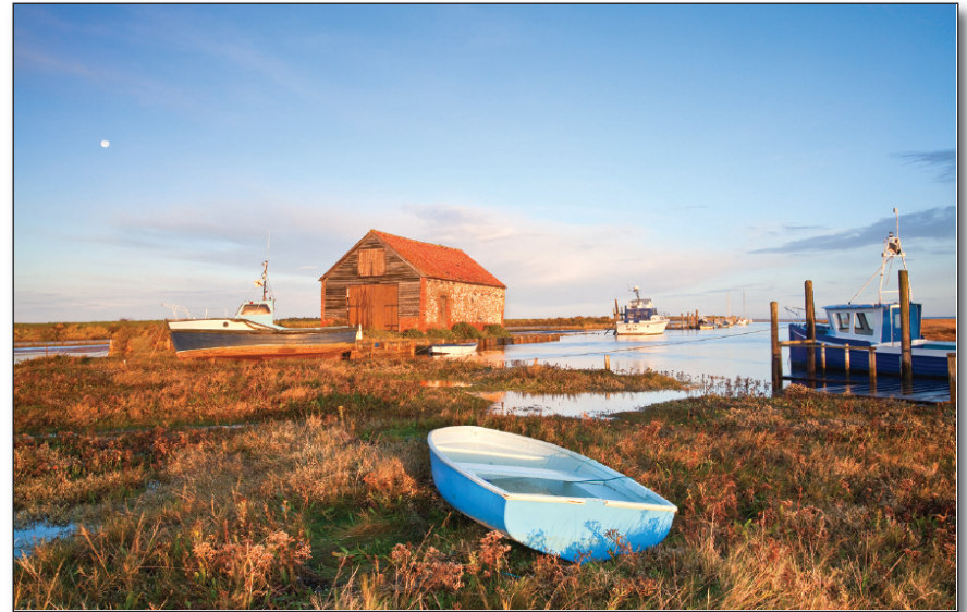
A high tide is captured here at first light as the salt marshes at Thornham Creek start to flood on the north Norfolk coast. In the background the old coal shed is the only building that remains of a once bustling Thornham Harbour.