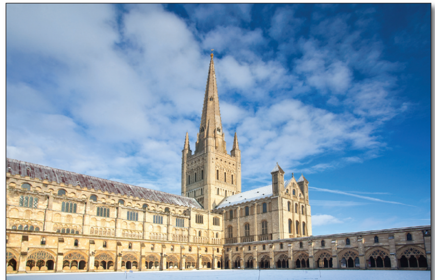
Norwich Cathedral has dominated the city skyline for over 900 years.