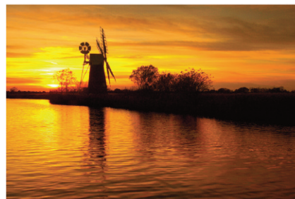
Winter is a great time to witness dramatic sunsets on the Norfolk Broads. In summer this view of Turf Fen drainage mill on the River Ant would usually be completely blocked by holiday boats. However in the winter months, with the tourists long gone, the Broads have a completely different feel about them.